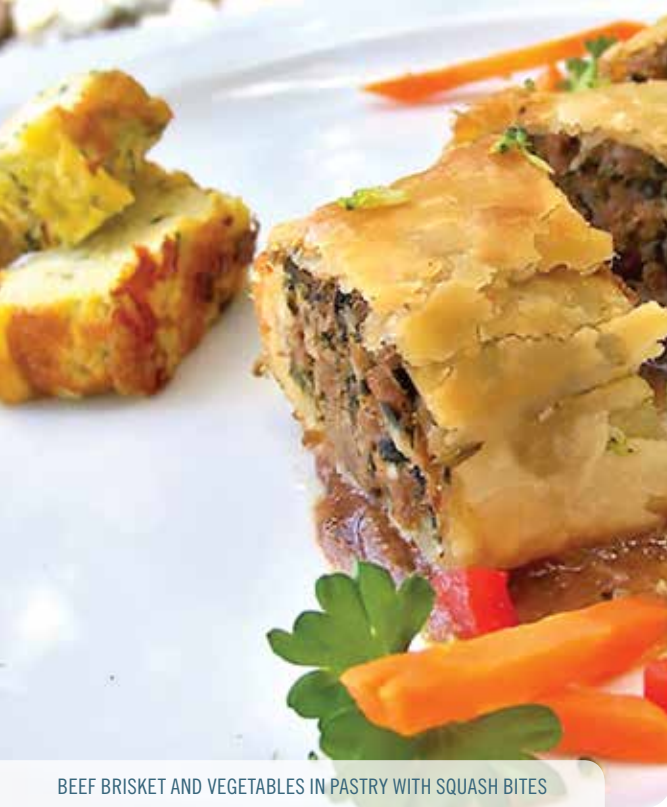
BEEF BRISKET AND VEGETABLES IN PASTRY WITH SQUASH BITES