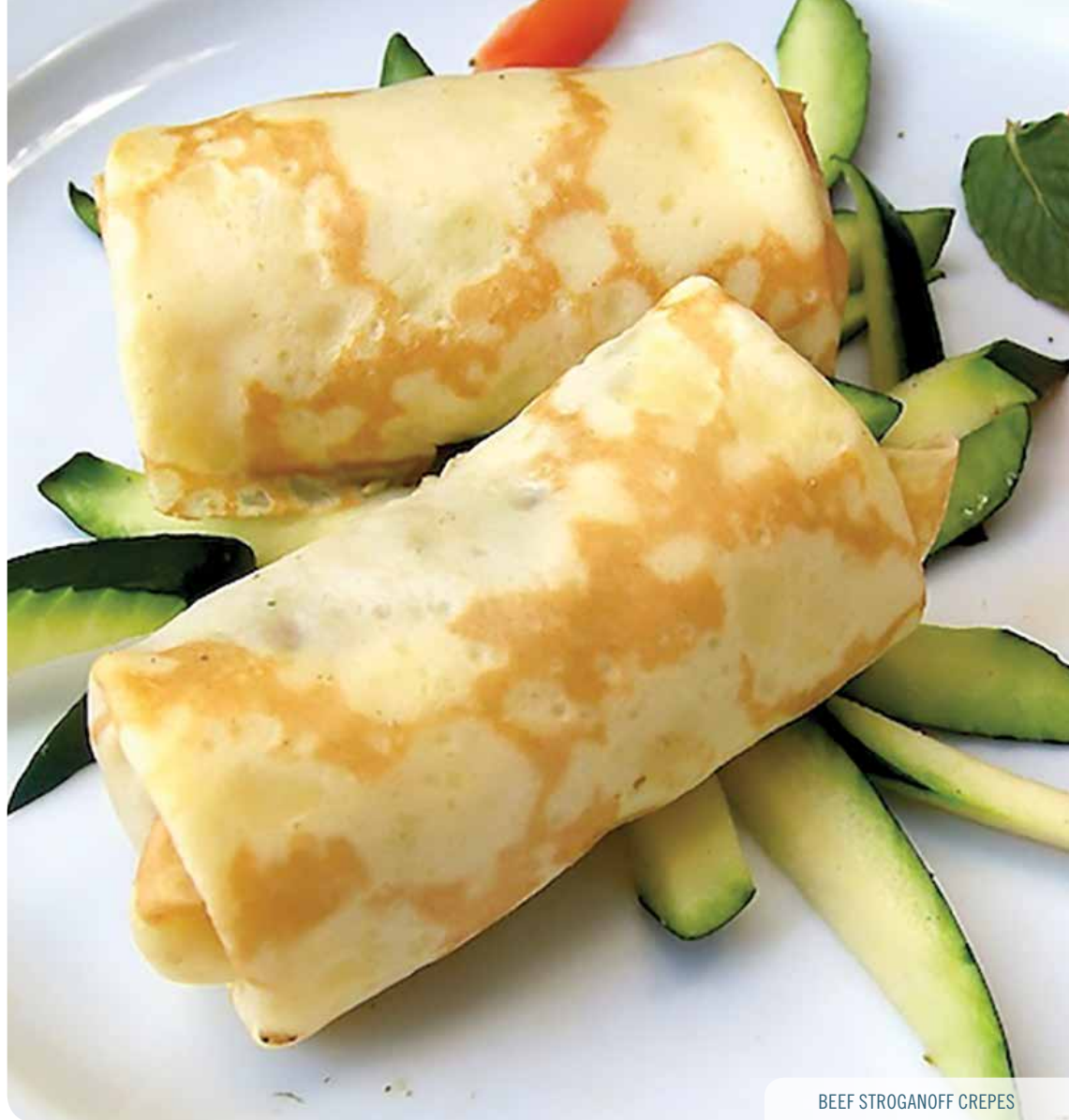
BEEF STROGANOFF CREPES

Bringing joy back to dining for individuals with physical and cognitive challenges.